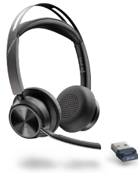
VOYAGER FOCUS 2 UC