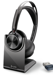
VOYAGER FOCUS 2 UC WITH CHARGE STAND