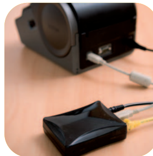
*Standard address label, 4 line, text only