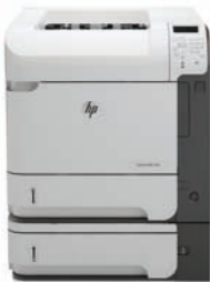
HP LaserJet Enterprise 600 M603xh