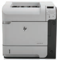
HP LaserJet Enterprise 600 M603dn