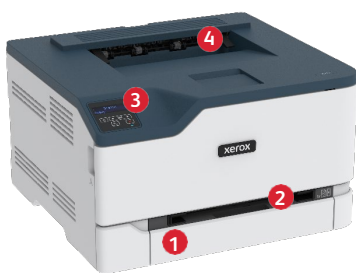
Xerox® C230 Colour Printer