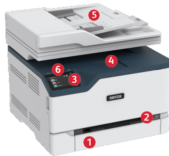
Xerox® C235 Colour Multifunction Printer