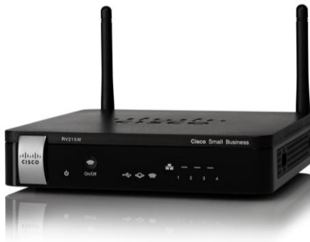
Figure 1. Cisco RV215W Wireless-N VPN Router

The Cisco® RV215W Wireless-N VPN Router provides simple, affordable, highly secure, business-class connectivity to the Internet from small and home offices and remote locations.