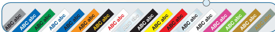
Labels shown are illustrative only. Actual output (such as font and margins) varies.

Creates durable, laminated labels in a variety of colors. Prints big, bold labels up to 24mm wide!