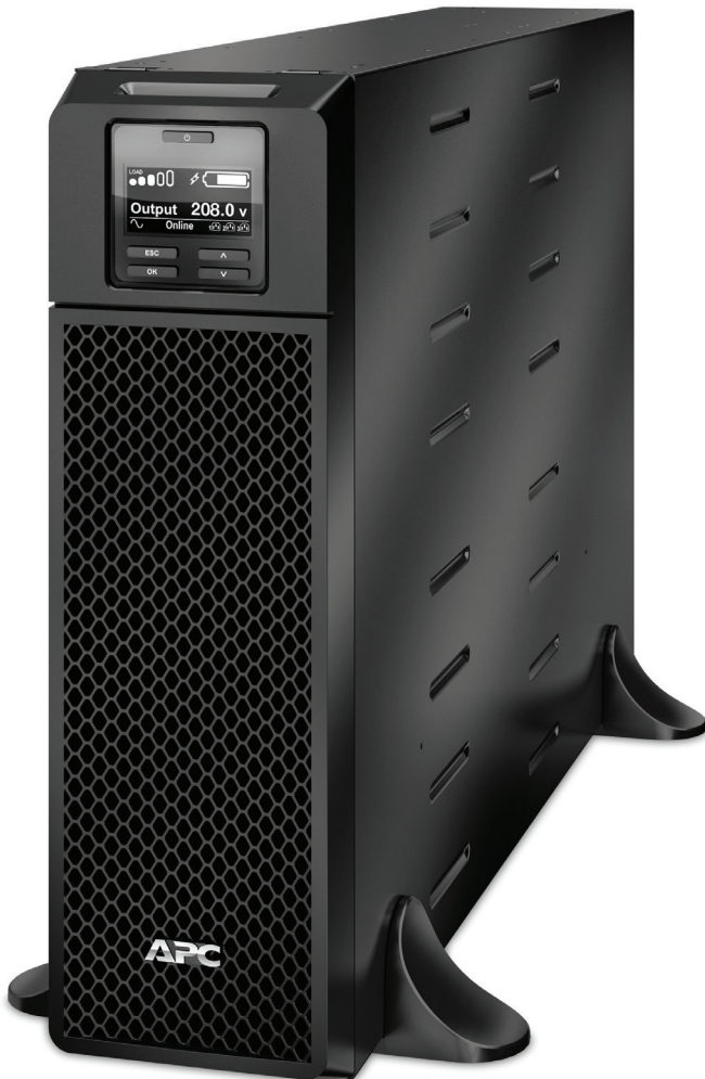
[ SRT5KXLT shown ]