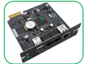
Network Management Card